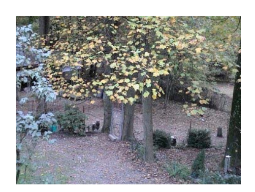
Image: "A*starz Kennel" This page is maintained by Donna Stekli Last updated 02/08/2006